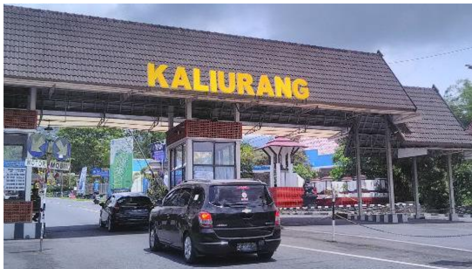
Figure 1. Entrance to Kaliurang Tourism Area [2]

Kaliurang is a tourism icon in Sleman Regency, so it is not from the waste problem. To maintain the comfort of the tourists, the Sleman Regency government invites residents to manage waste jointly. Also, Sleman Regency is a water buffer area for all regencies/cities in Yogyakarta Special Region Province [3]. In the 2019 National Waste Management Day Commemoration event (HPSN) by all the Technical Implementation Units (UPT) Conservation of Natural Resources and Ecosystems (KSDAE), the Ministry of Environment and Forestry in Kaliurang Tourism Area produced 170 kgs of waste consisting of 115.5 kgs of organic waste and 54.5 kgs of inorganic waste [4].