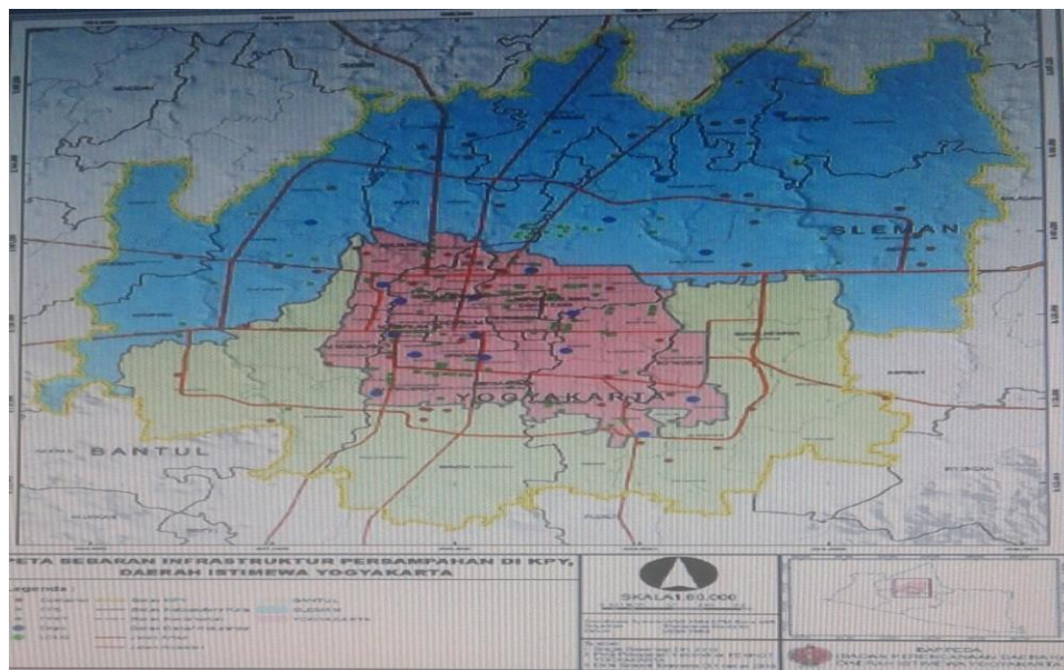
Figure 2. Map of distribution of waste infrastructure of KPY [3]

The distribution of waste infrastructure in the Urban Area of Yogyakarta is shown in Figure 2 below,